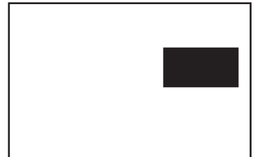
Right banner (300x200)