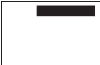
Top banner (730x90)